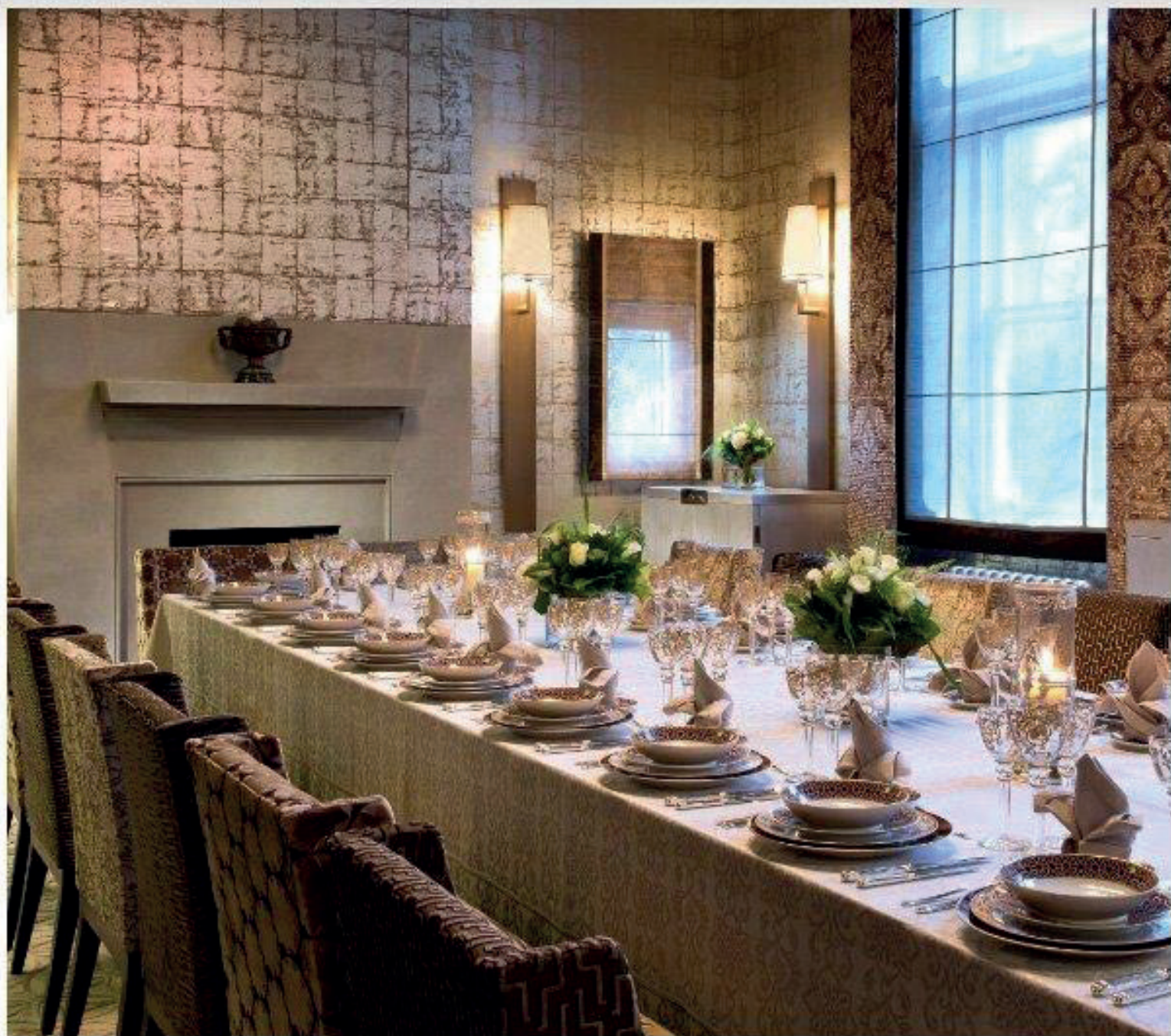
Bespoke chairs by Inema surround the Promemora table

life, comfort, sensuality, rigour and poetry were not lost in this luxury-without-ostentation setting.