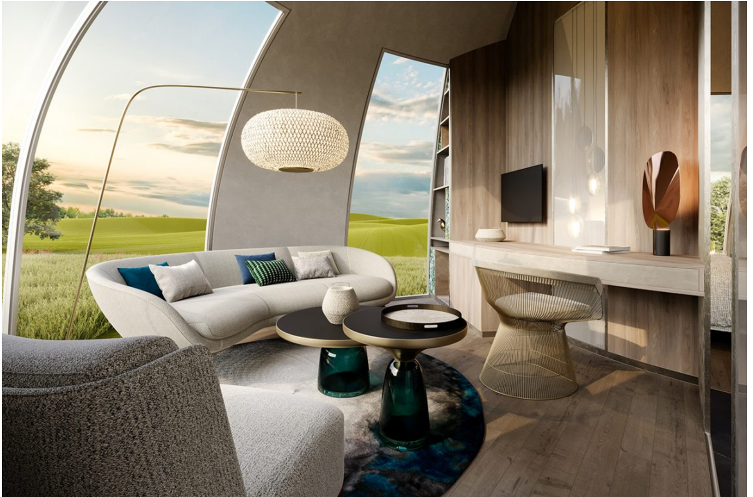
LE COCON DE LUXE

It is a space to isolate, alone or as a couple, and awaken one's senses to a benevolent nature, rich in positivity and inspiration. One can curl up to revitalise oneself, to escape from the everyday city-living pressures, to protect oneself from a world which has become so worrisome. Wide openings play between the indoor and outdoor boundaries to create a sense of freedom and space. Inside, a day area and a night area, are connected together. The fluid layout follows a path of elliptical curves which wrap around the space without restricting the flow.